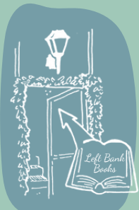
Left Bank Books